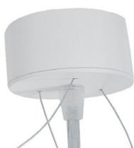
Finestra Ring 3x Suspension set 1,5m 5x0,75mm 2