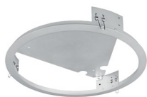
Ramka GK Finestra Ring