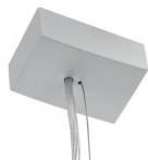
Electrical suspension Pieces in set: 1